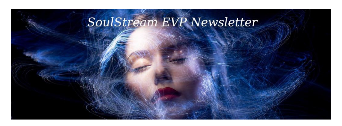
January 2023 EVP Newsletter