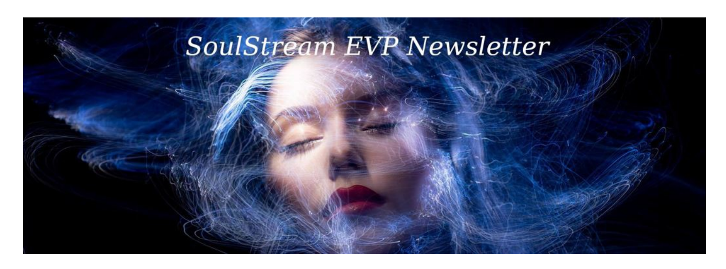
January 2023 EVP Newsletter

https://www.youtube.com/watch?v=-fVh35VSnZo