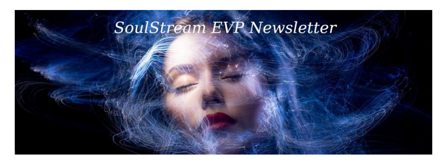
January 2023 EVP Newsletter

with me and I will be sure to add it to the newsletter.