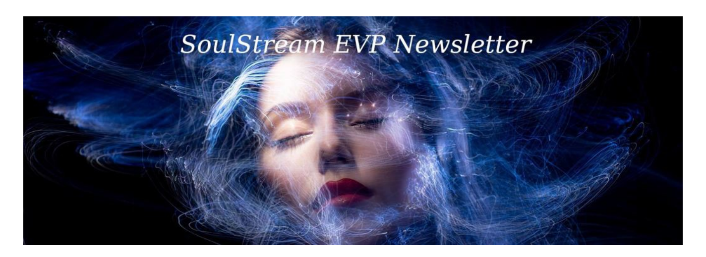
January 2023 EVP Newsletter

https://www.phenomenamagazine.co.uk/about/