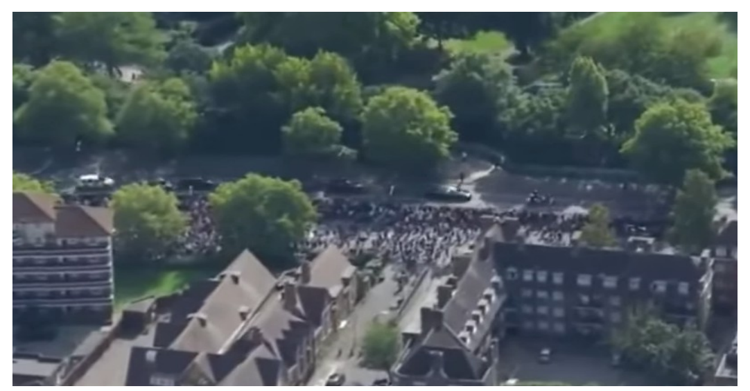
Illustration 1: The Queen's motorcade as she was sped to her funeral in September 2022

The voice said: "The death is irreversible and the fact that she's trapped" was spoken, with the last part of the sentence trailing off as the male announcer began to speak.